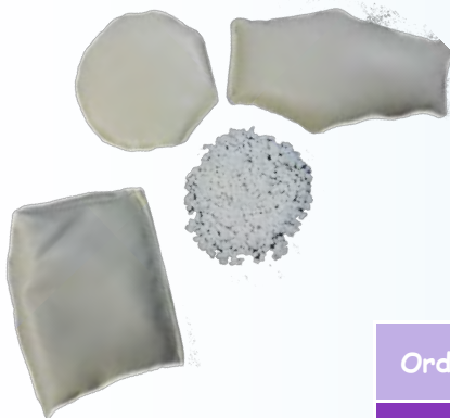
2 Sizes Available