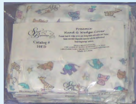
Packaged Posture Pillow Disposable Covers