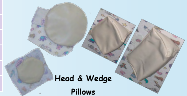
Head & Wedge Pillows